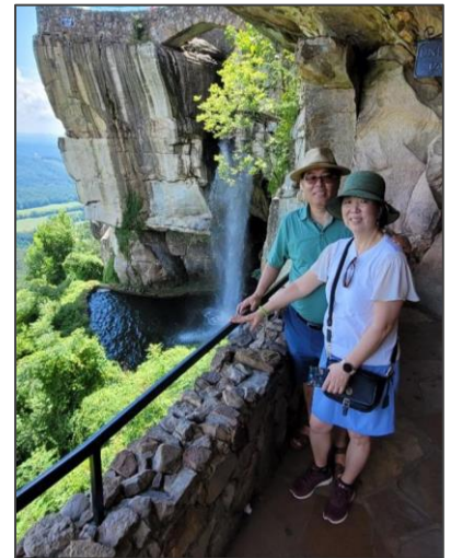
A visit to Rock City, Chattanooga, TN

In 2019, the New York Annual Conference already organized all churches into cooperative parishes. The conference was to make the church's ministry more effective through mutual cooperation and support for evangelism and mission in