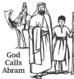
God Calls Abram

Some of you might be discouraged and disappointed because nothing remarkable like a resurrection happened after Easter. But we need to remind ourselves that we are pilgrims. Pilgrim tells us we are people who spend our lives going someplace, going to God, and whose path for getting there is the way of Jesus Christ. We realize that "this world is not my home" and set out for "the Father's house." Abraham, who "went out," is our archetype.