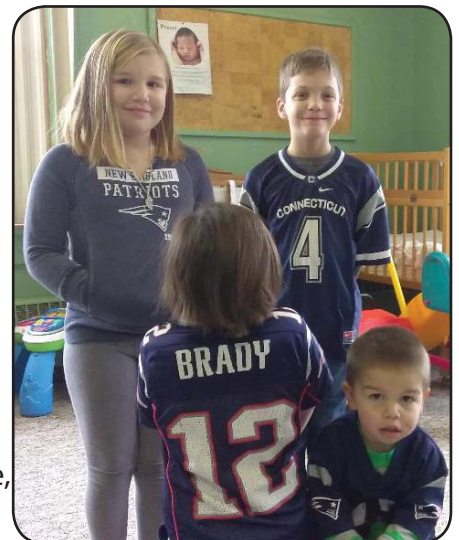
Youth in their tackle hunger team gear.

Our PUMC youth, with your help, filled a trunk and back seat with food for the Agape House. The Agape House, Inc. serves the homeless and people in need in the Bristol community. Thank you for your help and support of the annual Souper Bowl of Caring! Your cup of soup made a big difference!